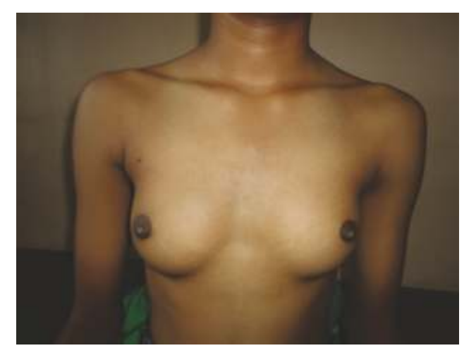
Fig. 1: Clinical Photograph Showing Significant Bilateral Gynaecomastia

A 16 year male patient came with history of swelling of left testis since one week. No history of trauma. No history of fever, vomiting, patient had undergone left laparoscopic orchidopexy five years back. General physical examination revealed bilateral gynaecomastia (Fig.1).